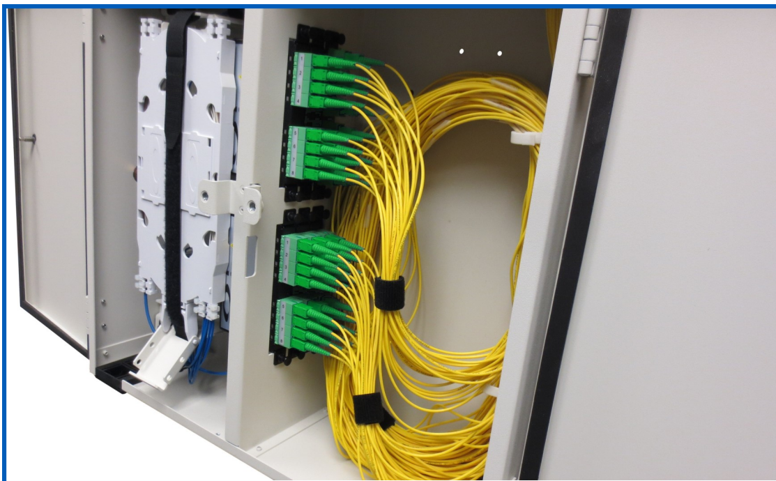
Fiber Demarcation Box Gen 3 with HiD4p Cassettes