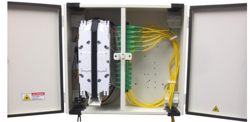
Fiber Demarcation Box Gen 3

MPO connectors can also be leveraged in the FD3. Fanouts terminated with an MPO connector are available with the MPOs mounting on the splice tray.