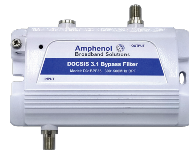
Band Pass Filter

Who needs this kit? Operators to test and maintain their systems. Equipment makers to verify their products can meet the high specifications of the operators. Analyzer manufacturers to prove the readings they measure are not the limitations of the analyzer itself, but the system tilt is the reason for low measurements.