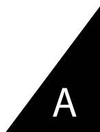
A: (2) Triangular Mounting Brackets